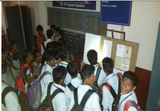
Students checking the result of First Round